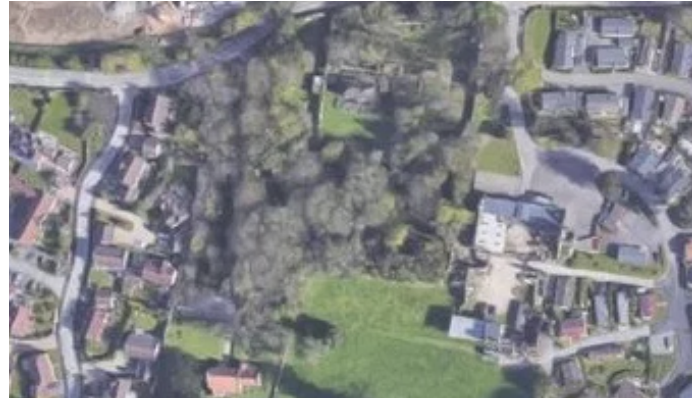
1990s to 2022:

Site very open and used as a Market Garden