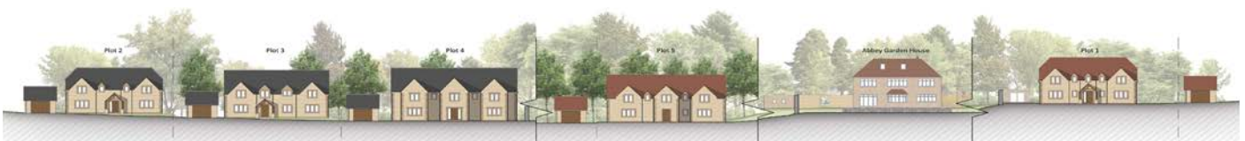
Proposed 'wrap around' front elevation of houses