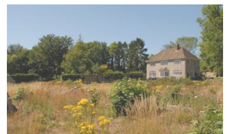
Abbey Garden House and the area in front of it which will remain as a landscaped green open space