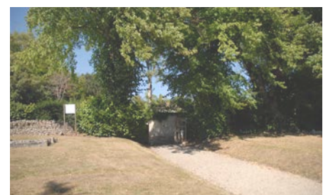
View looking north east from St Andrews Churchyard towards the site showing screening effect of existing mature trees and vegetation