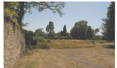
Part of the south eastern development area of the site with walls and trees shown to be retained