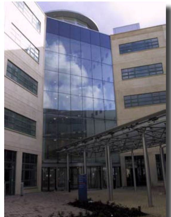
7. Royal Naval College, Greenwich