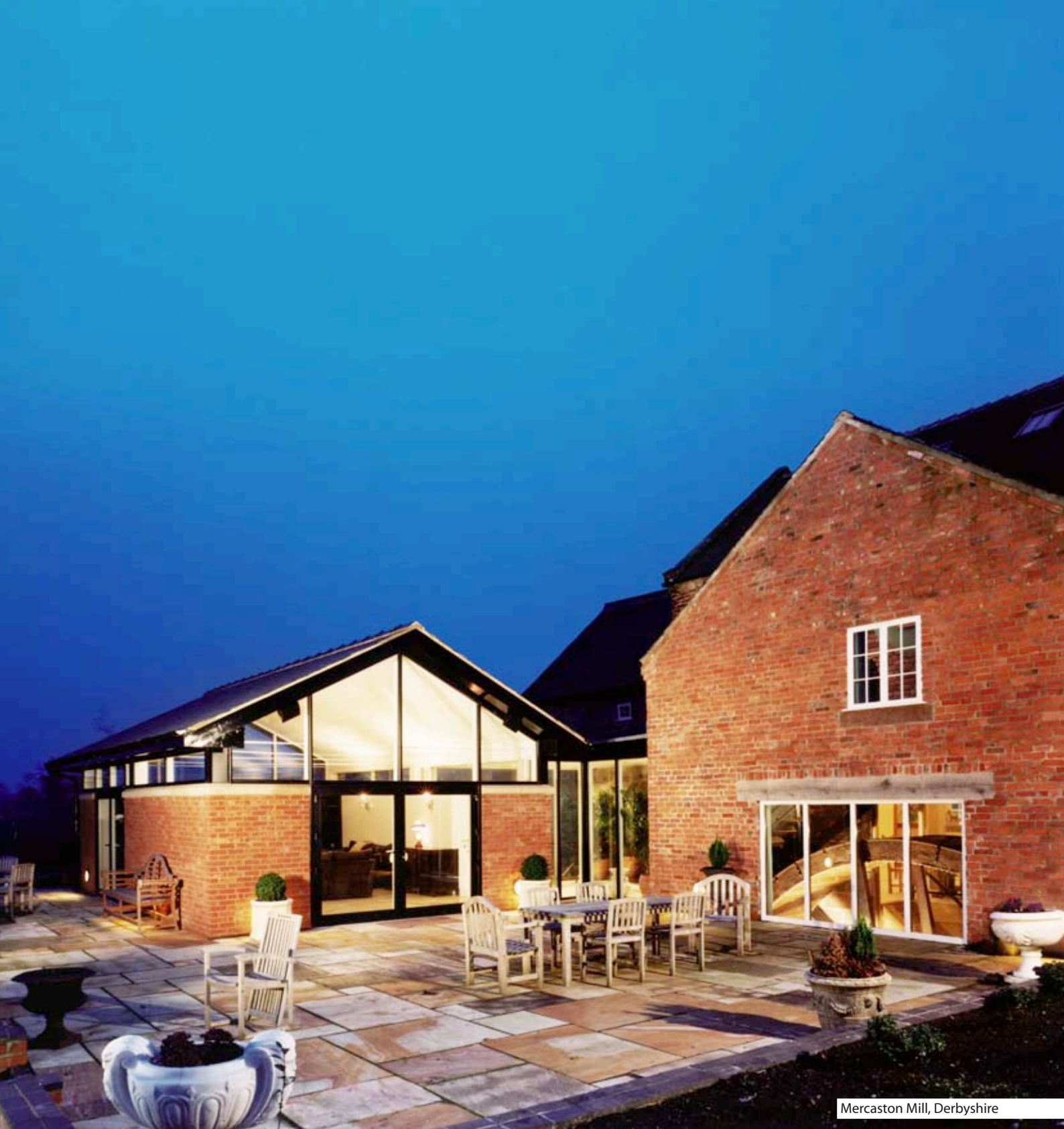
Mercaston Mill, Derbyshire